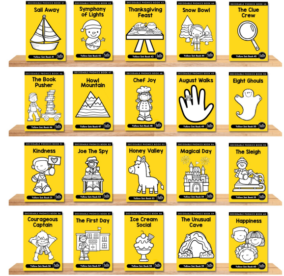
SKU Y41601 Hello Decodables Fiction Yellow Books - Individual Set