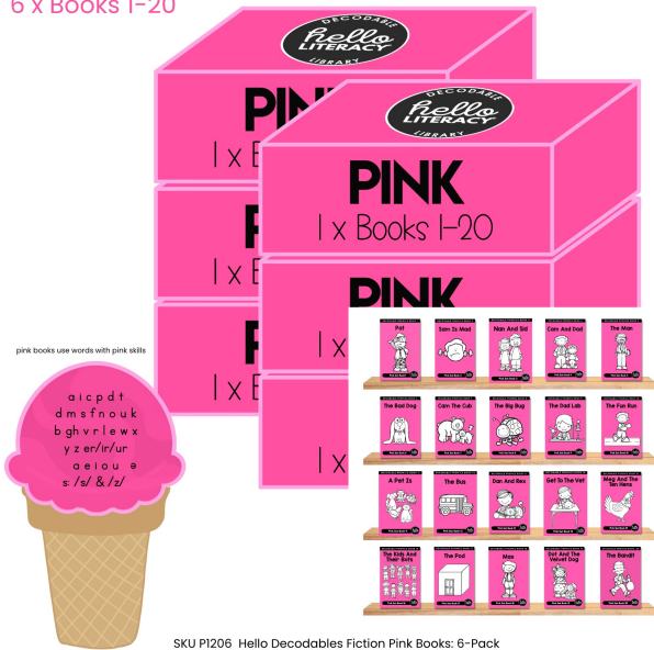
SKU P1206 Hello Decodables Fiction Pink Books: 6-Pack