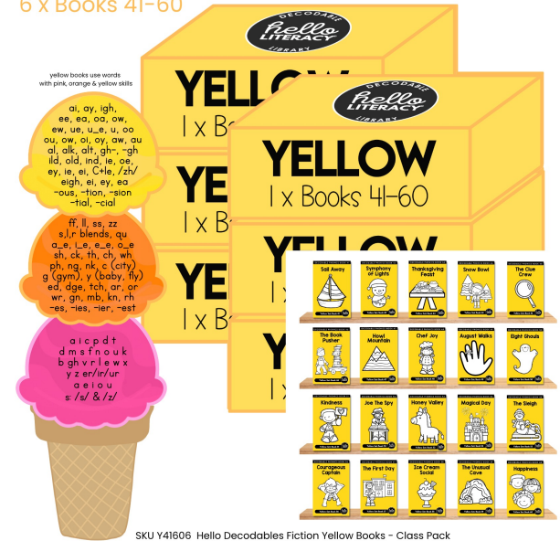
SKU Y41606 Hello Decodables Fiction Yellow Books - Class Pack

Ready to ship at www.hellodecodables.com