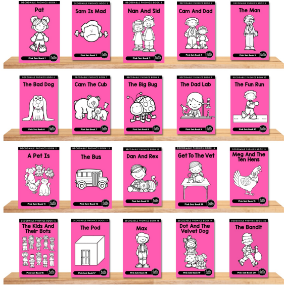
SKU P1201 Hello Decodables Fiction Pink Books - Individual Set