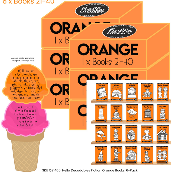
SKU Q21406 Hello Decodables Fiction Orange Books: 6-Pack