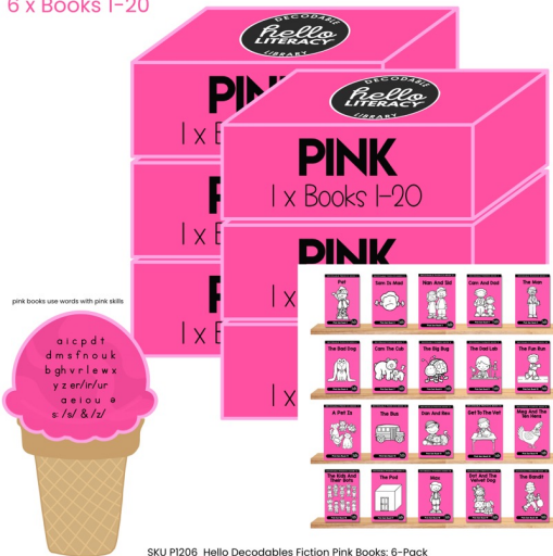
SKU P1206 Hello Decodables Fiction Pink Books - 6-Pack