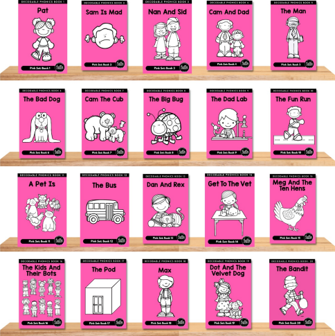
SKU P1201 Hello Decodables Fiction Pink Books - Individual Set