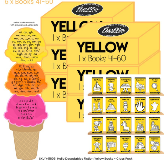
SKU Y41606 Hello Decodables Fiction Yellow Books - Class Pack