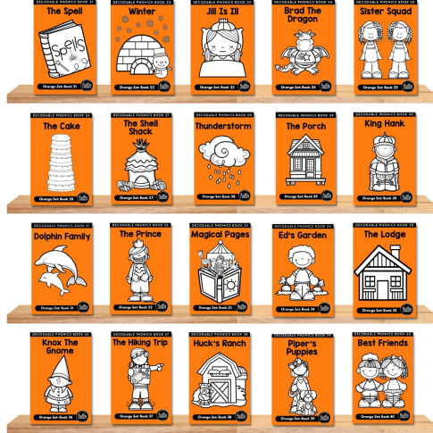
SKU Q21401 Hello Decodables Fiction Orange Books - Individual Set