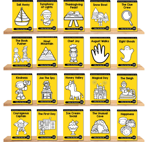
SKU Y41601 Hello Decodables Fiction Yellow Books - Individual Set